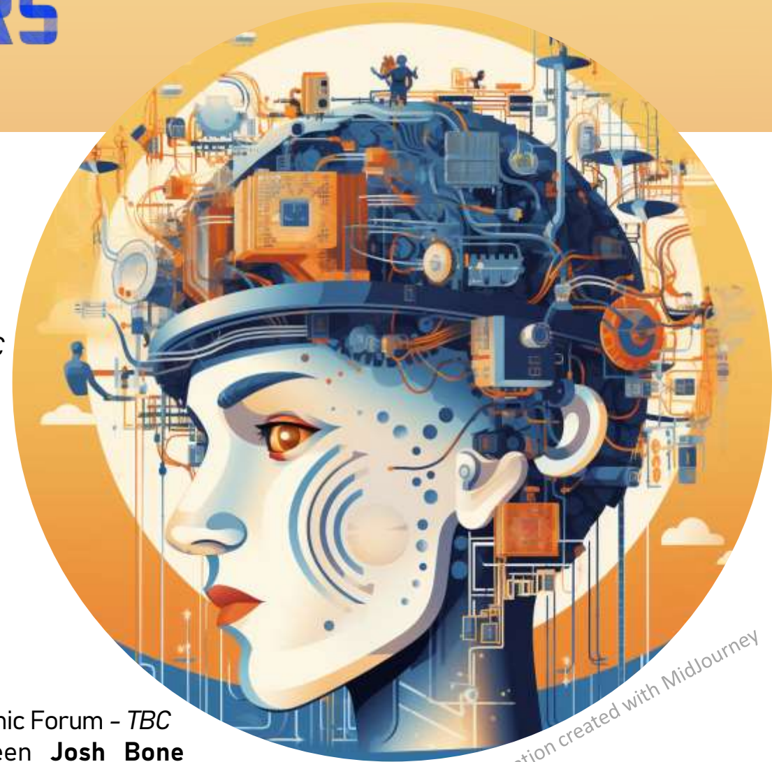
Illustration created with MidJourney